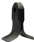
Hammer type "Y"

The technical data are indicative, not binding and are subject to modification without prior notice.