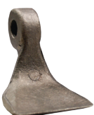
Hammer type "PML"

Data refers to the machine without options.